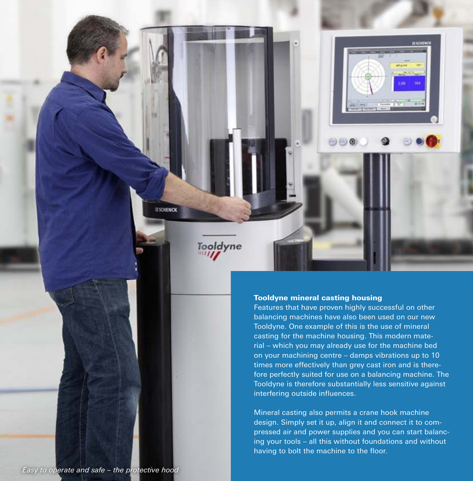
Easy to operate and safe – the protective hood