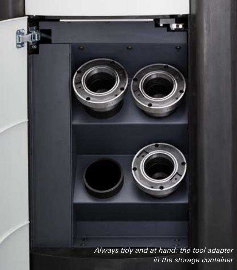
Always tidy and at hand: the tool adapter in the storage container