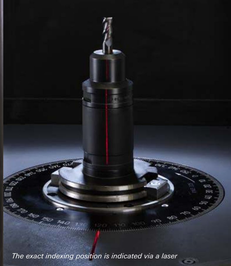
The exact indexing position is indicated via a laser