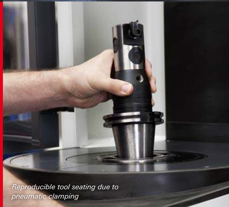
Reproducible tool seating due to pneumatic clamping

The measuring unit is clearly visible and allows you simple and direct input of all data via a touch screen. The logical operating concept with clear and easily understandable displays using symbols aligned to touch screen operation as well as a comprehensive range of operating aids will quickly make the Tooldyne a popular working device.