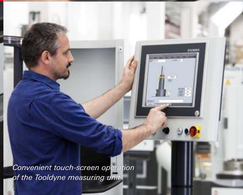
Convenient touch-screen operation of the Tooldyne measuring unit