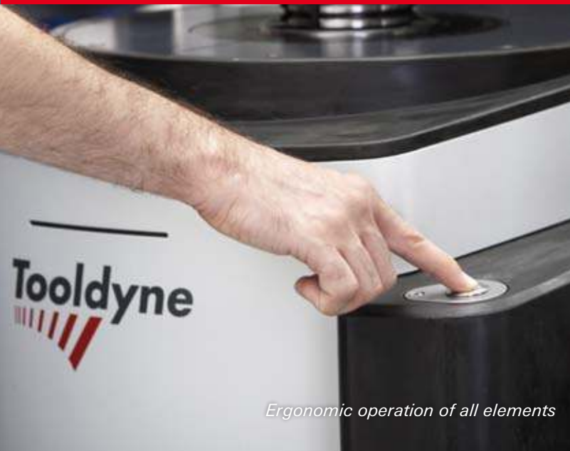
Ergonomic operation of all elements