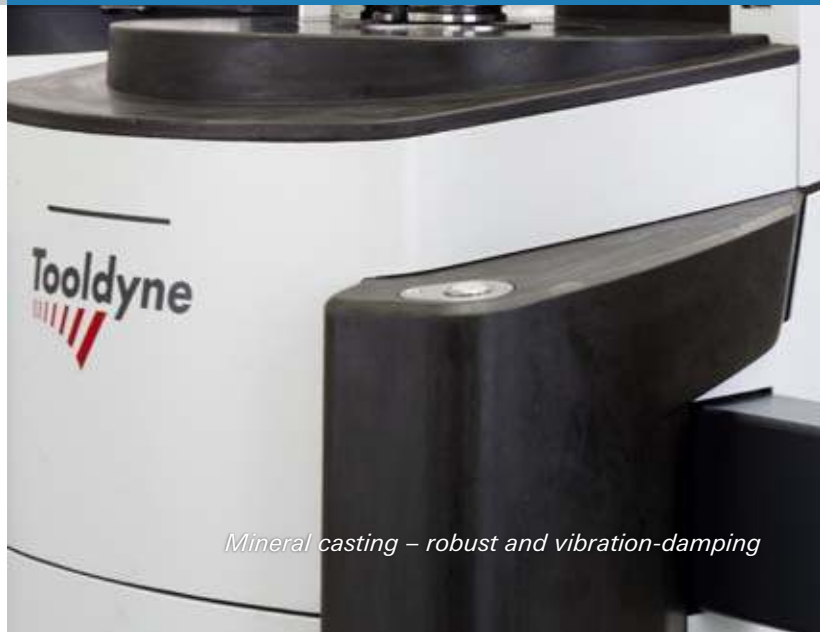
Mineral casting – robust and vibration-damping

We have also ensured that many other components are safe in that they cannot clamp fingers and that adjustments can be carried out almost entirely without tools. The function of each component is safe and easy to understand.